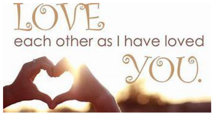
Fifth Sunday of Easter